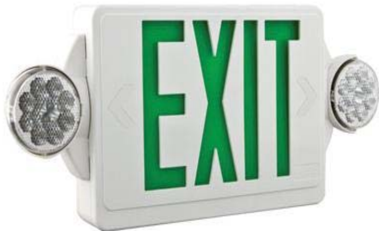
LHQM LED Fixture