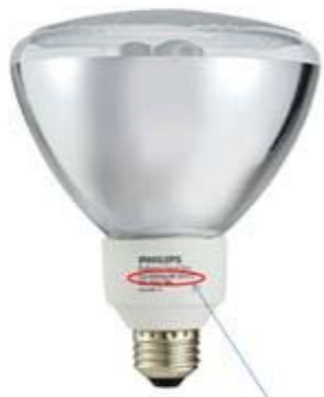
Model: EL/A Par38 Dim 20w