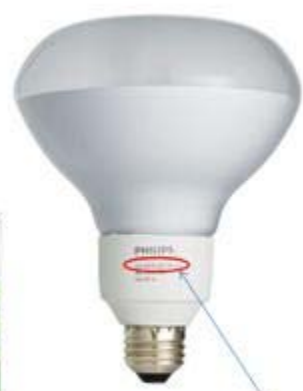
Model: EL/A R40 Dim 20w