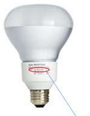
Model: EL/A R30 Dim 16w